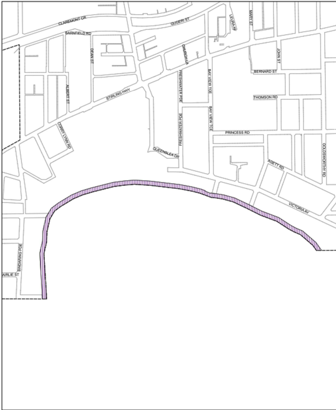
Map 2 - Cat Prohibited Area Claremont Foreshore Reserve