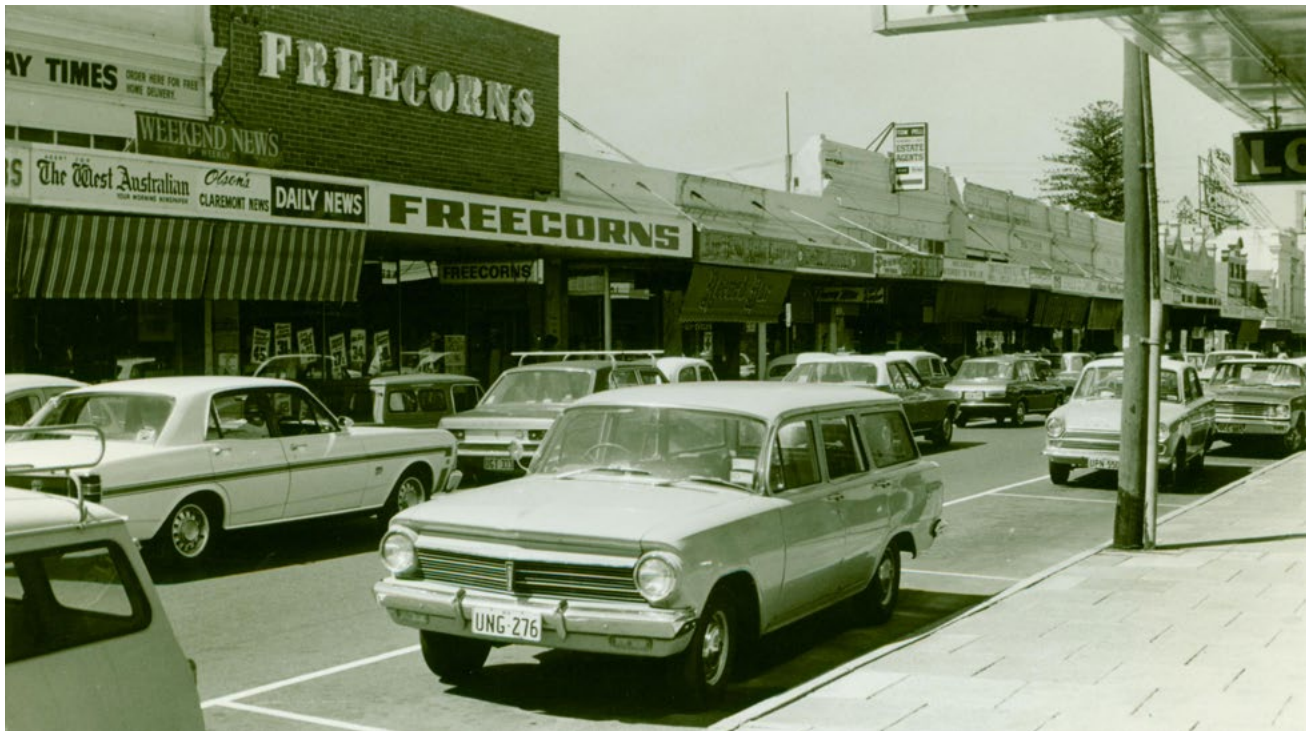
Bay View Terrace c1970s