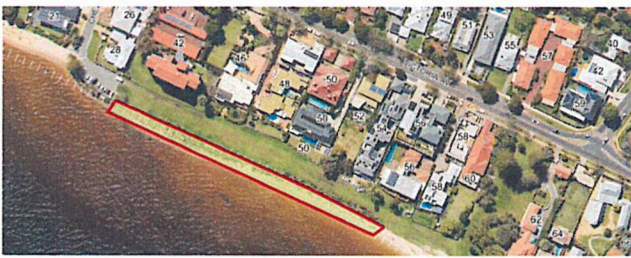
Sand to be relocated to the East of Chester Road car park.