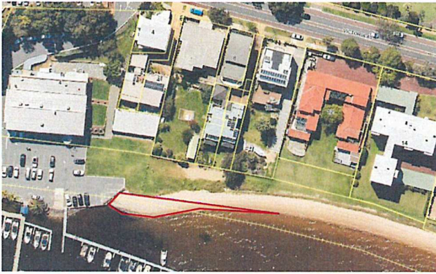
Sand to be removed from East of Claremont Yacht Club.