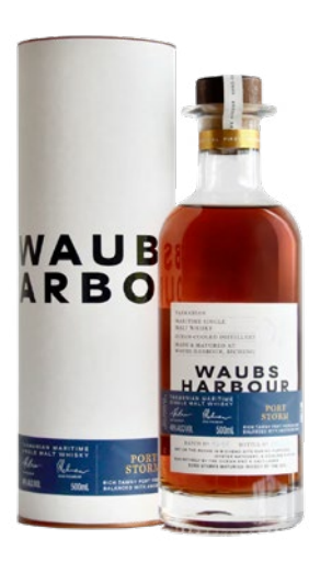
8. Waubs Harbour Port Storm Single Malt Whiskey $212 Liberty Liquors