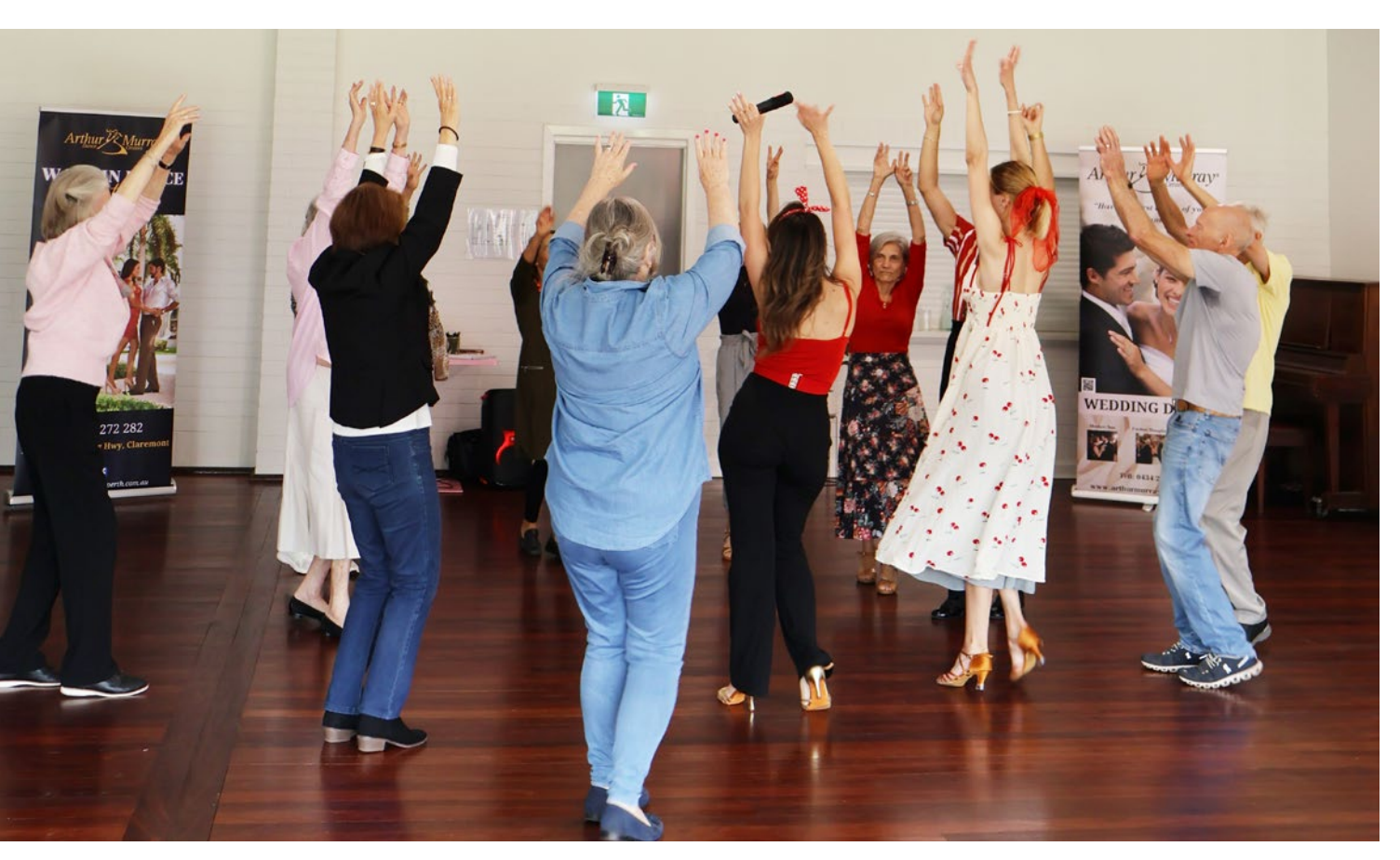
Senior's Week dancing class at Bay View Community Centre