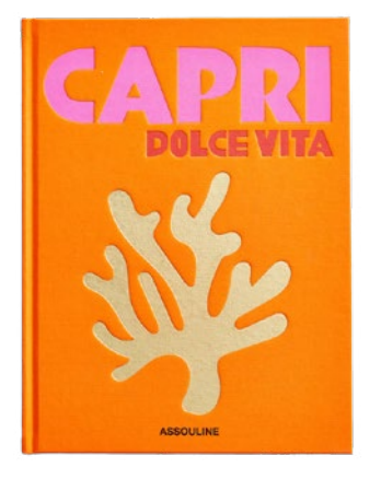
13. Capri Coffee Table Book $185 Empire Homewares