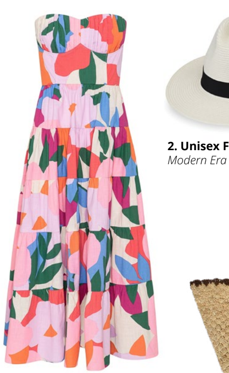
1. Lulu Dress in Acapulco $249 Mister Zimi