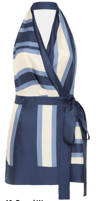
10. Dazed Wrap Halter Mini Dress $420 SIR The Label